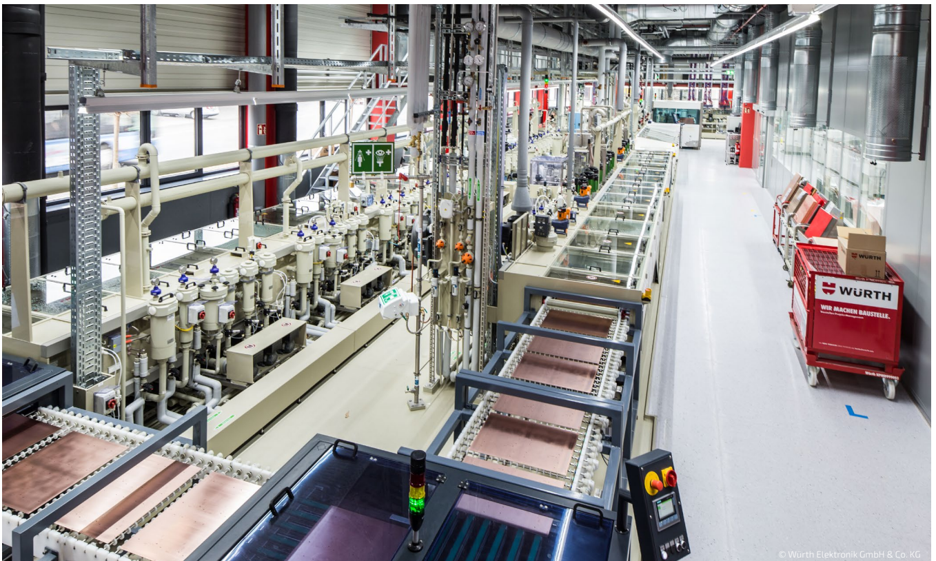
Horizontal line for the metallization of holes with the processes deburring, cleaning and desmear, chemical and galvanic copper deposition

The information shown can now be used to detect common faults and eliminate their causes. This has led to improved equipment availability. Product defects can now be analyzed more effectively and largely avoided in future by means of process improvements.